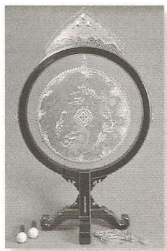
Tsuri-Daco (Hanging Drum), Japan, Edo Period (1603-1868)

MIM's collection consists of more than 12,000 instruments and associated items, representing every country in the world. These instruments were selected for their fine construction, the reputation of their makers, special provenance, or connection to famous performers. More than 3,000 items from MIM's permanent collection will be highlighted at the grand opening in Geo-Galleries that focus on five global regions: Africa and the Middle East, Asia and Oceania, Europe, Latin America and the Caribbean, and the United States and Canada.